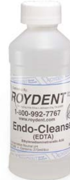
PL209 – 8 oz. bottle