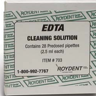
703 – 28 Pipettes